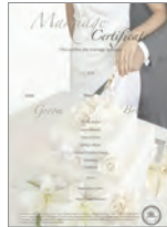
Cut the Cake

With each order for a commemorative marriage certificate package, you will receive a standard marriage certificate. Commemorative marriage certificates do not contain security features and organisations may not accept them as a proof of identity document. See separate Fees for Products and Services flyer.