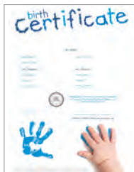
Handprint Blue (also available in pink)